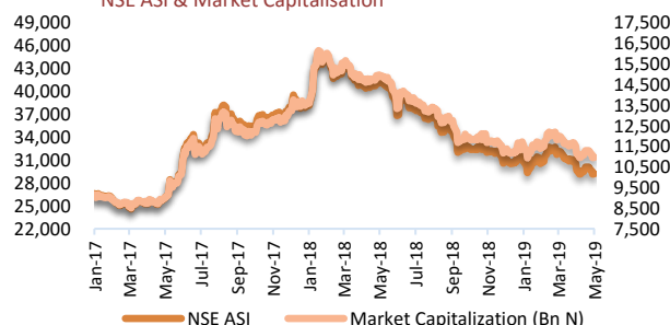
NSE ASI & Market Capitalisation

The NSE ASI dipped by 17bps amid renewed profit taking activities, although registering 20 gainers as against 19 losers at the sound of the closing gong. Consequently, the year to date loss of local stocks worsened to 0.56% from 0.39%. Similarly, tickers such as GUARANTY, FO and UNILEVER waned by 3.03%, 3.93% and 8.01% respectively, dragging the NSE Banking, NSE Oil & Gas and NSE Consumer Goods gauges down by 1.93%, 0.32% and 0.58% respectively. Also, the total value of equities traded dwindled by 18.97% to N5.89 billion. On the flip side, the total volume of equities traded increased by 9.44% to 376.80 million units. Meanwhile, NIBOR moved in mixed directions across tenure buckets; also, NITTY plummeted for most maturities tracked amid buy pressure. In the bonds market, the values of OTC FGN papers moved in mixed directions across board; while, FGN Eurobond prices fell for most maturities tracked on bearish run in the international capital market.